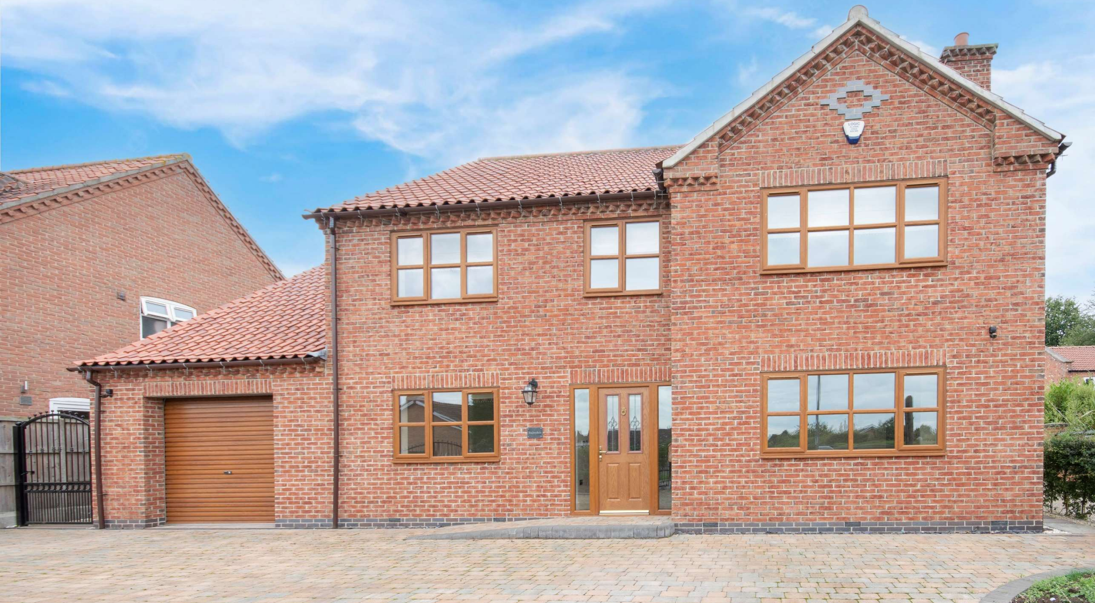
BAILEYDALE, SOUTH LEVERTON £555,000