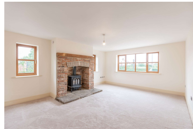
DINING ROOM 12'0" x 11'6" (3.66m x 3.50m) front aspect window, double doors to reception hall.

LOUNGE 18'6" x 14'0" (5.64m x 4.27m) measured to rear of chimney breast with substantial rustic brick fireplace, stone flagged hearth and multi fuel stove, oak beam over. Dual aspect.