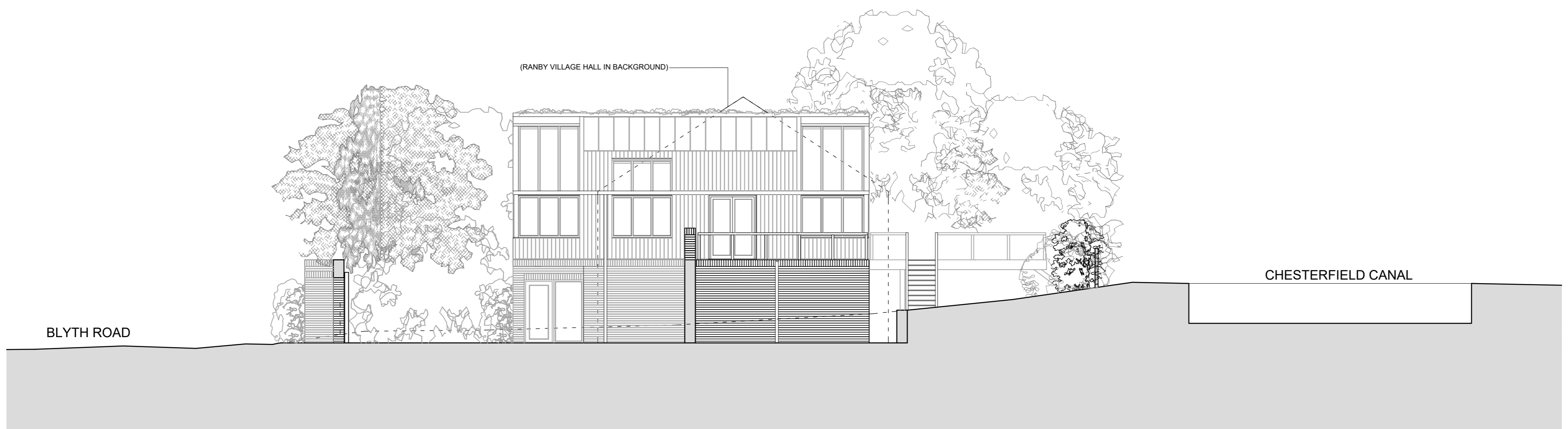
SITE SECTION Cii-Cii (SOUTH ELEVATION HOUSE THREE) AS PROPOSED