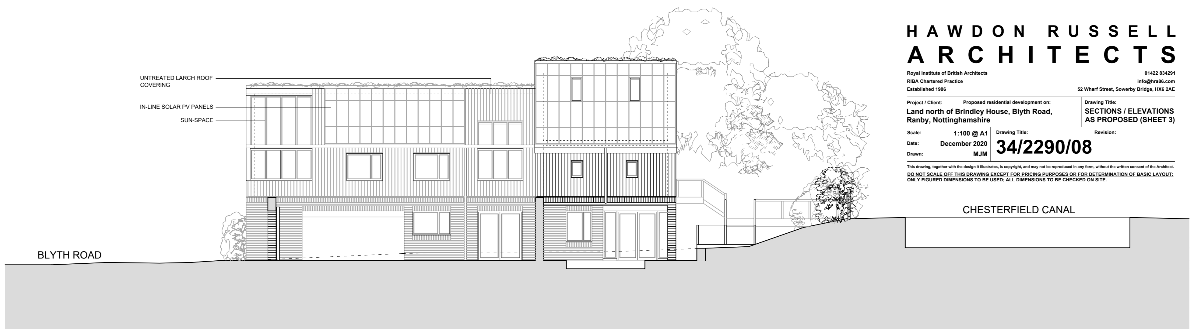
SITE SECTION Bi-Bi (SOUTH ELEVATION HOUSE TWO) AS PROPOSED