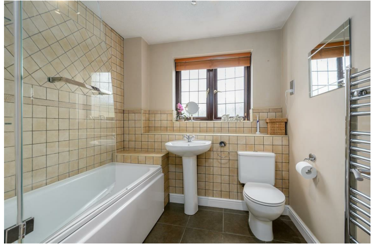
With a window to the front aspect, fitted with a low level w/c, pedestal wash basin and a panelled bath with a shower over and glass screen. Heated towel rail / radiator.