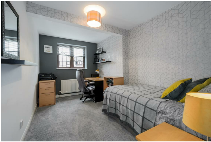
With window to the front aspect.