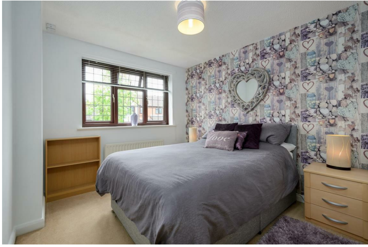
With window to the front aspect.