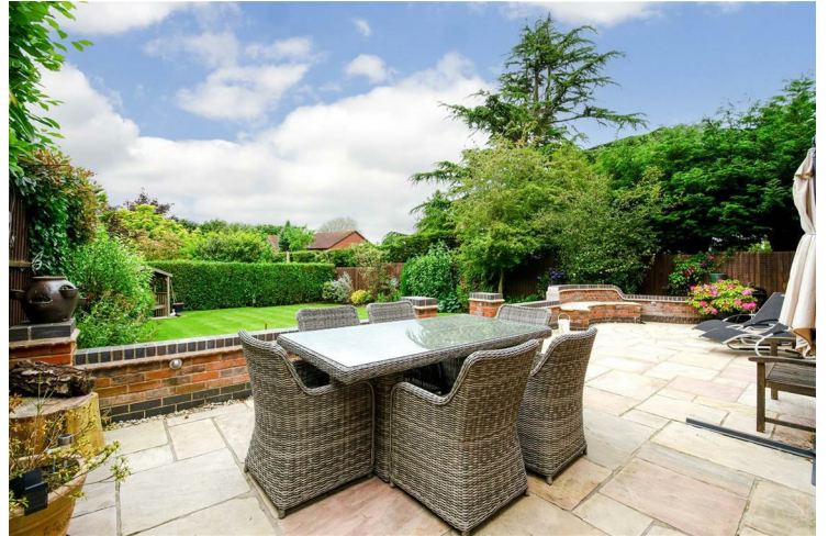
A particular feature of this property is the plot on which it sits. The enclosed and private rear garden has been beautifully maintained, being laid largely to lawn with mature borders containing a mixture of flowers, plants and shrubbery, and a substantial raised patio area. To the front of the property is a further area of lawn and a block paved driveway.