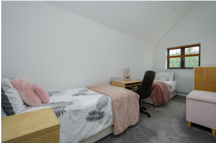
With window to the front aspect.