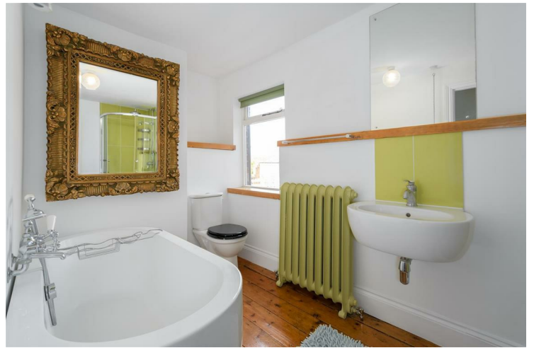
With a window to the side aspect, fitted with a low level wc, wash basin, free standing bath and a separate shower cubicle. Radiator.