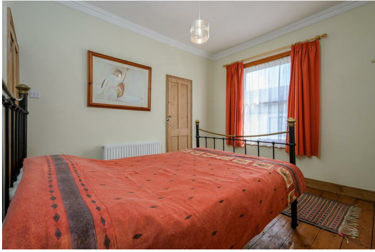
With a window to the front aspect, storage cupboard, radiator.