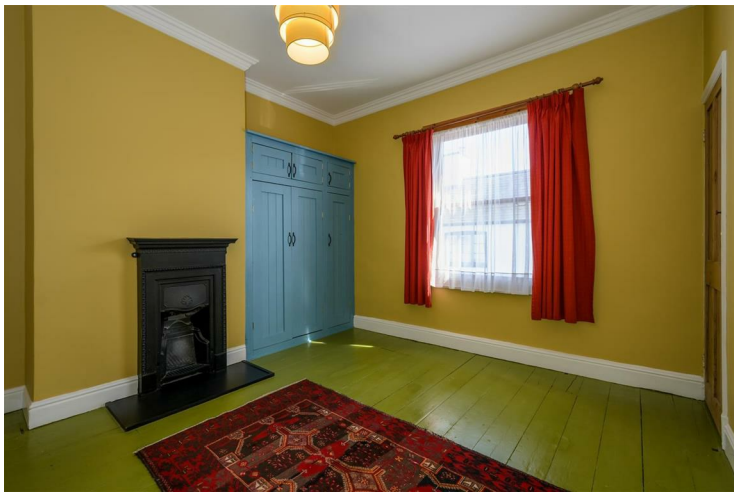
With a window to the front aspect, two fitted storage cupboards one with access to the loft space, radiator.