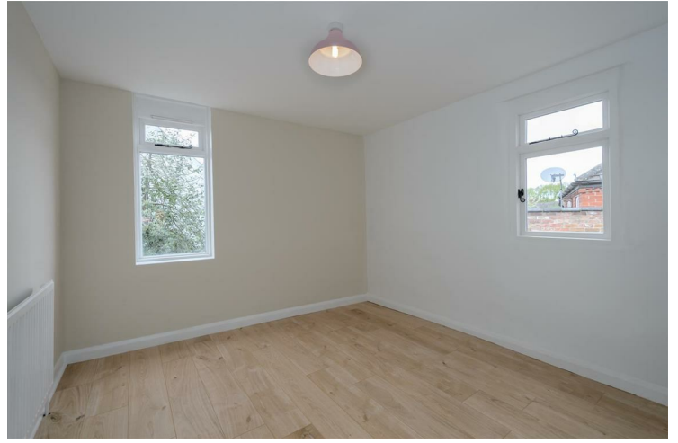
With windows to the rear and side aspects, built-in storage cupboard, radiator.