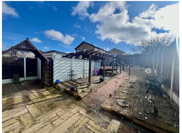
The enclosed and generous rear garden is laid largely to pavings and ornamental garvel. To the front of the property is driveway parking which inturn leads to the garage.