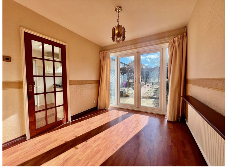
With doors to outside and the kitchen. Radiator.