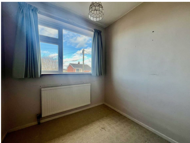
With a window to the front aspect, radiator.