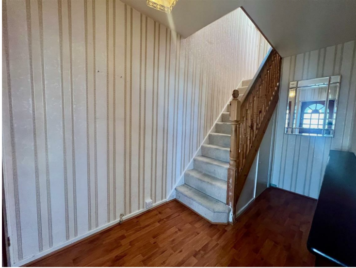
With stairs off rising to the first floor, and a door to the living room. Radiator.