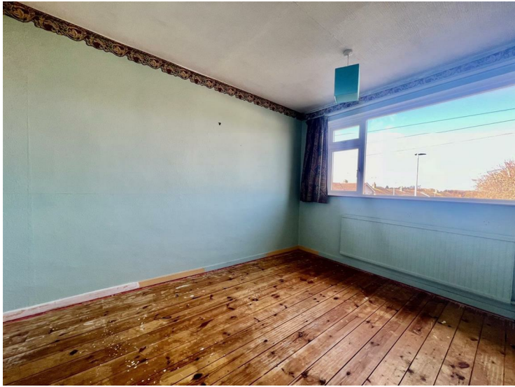
With a window to the front aspect, radiator.