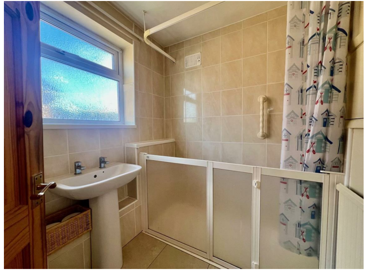
With a window rear aspect, fitted with a low level w/c, wash basin and shower area. Radiator.