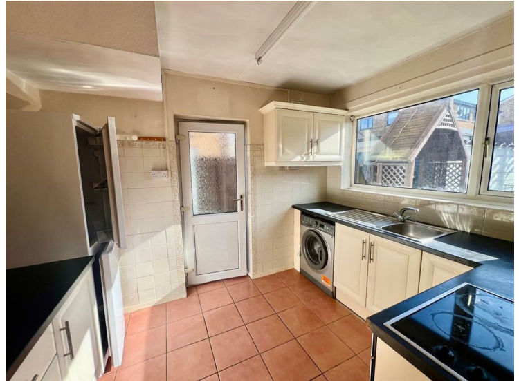
With a window overlooking the rear garden and a door giving outside access. Fitted with a range of eye level and base level storage units with rolled edge worksurfaces, tiled splashbacks and space / plumbing for a range of white goods.