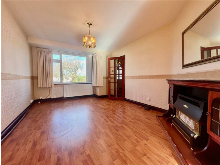
With a window to the front aspect, opening to the dining room, radiator.