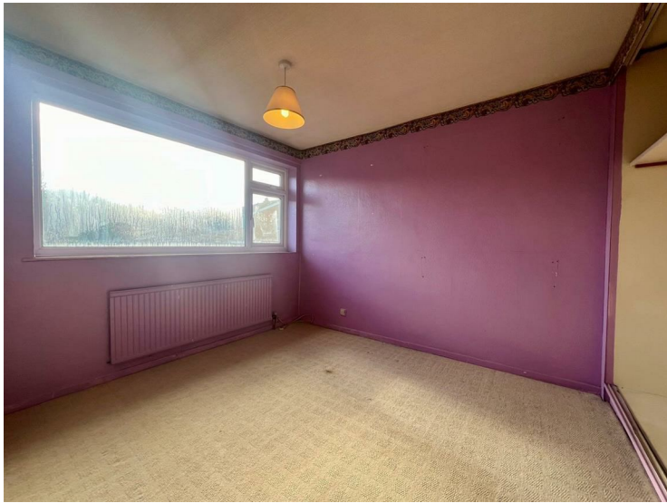
With a window to the rear aspect, radiator.