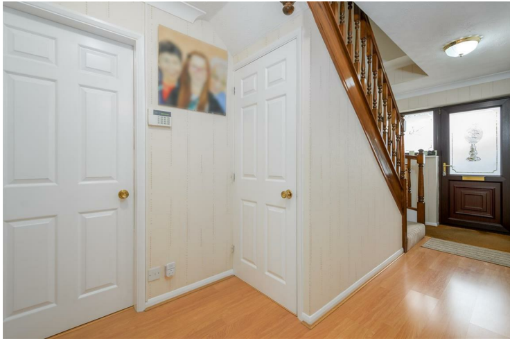
With stairs off rising to the first floor, radiator.