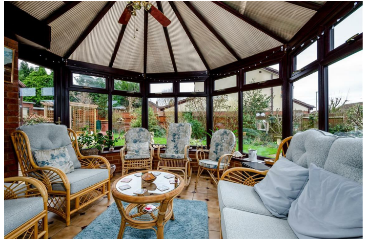
This excellent addition to the property provides a further versatile living space with windows overlooking the rear garden and a door to the outside.