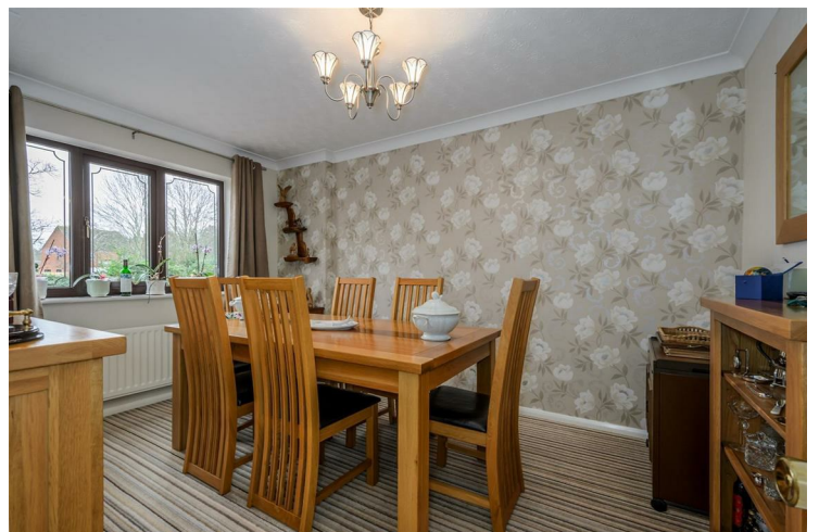
With a window to the front aspect, radiator.