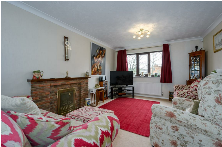
With a window to the front aspect, feature real flame coal burning effect gas fire, sliding patio doors to the conservatory, radiator.