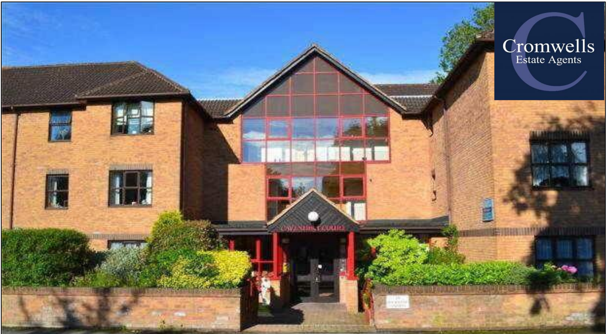
Cavendish Court, 15 Holmwood Gardens, Wallington, Surrey, Guide Price £125,000

A completely refurbished and beautifully presented one bedroom ground floor apartment, forming part of this select retirement development. The property benefits from a re modelled kitchen and bathroom and is situated in a quiet, yet, convenient location, close to Wallington town centre and train station.