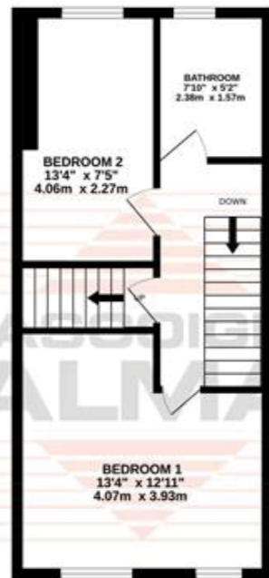
1ST FLOOR 391 sq.ft. (36.3 sq.m.) approx.