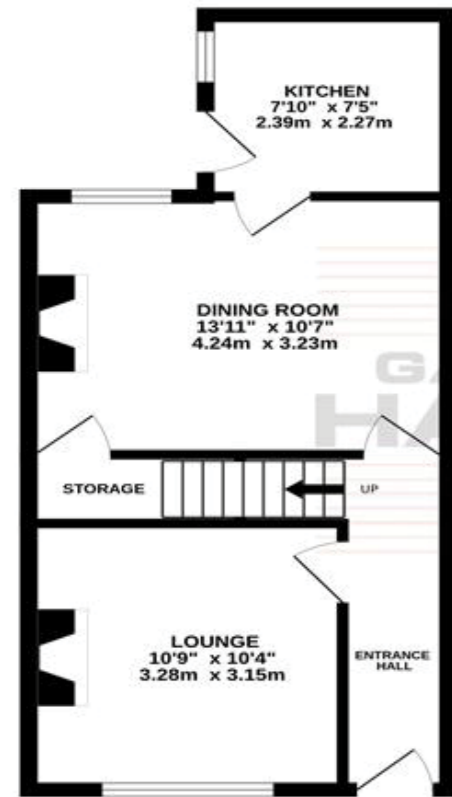
GROUND FLOOR 383 sq.ft. (35.5 sq.m.) approx.