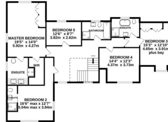
1ST FLOOR 1502 sq.ft. (139.5 sq.m.) approx.