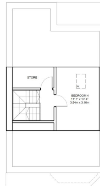
PLOT 03 Second Floor Plan 188.3 sq.ft / 17.5sq.m Total 1725 sq.ft / 160.5 sq.m

NOTICE Gascoigne Halman for themselves and for the vendors or lessors of this property whose agents they are give notice that: (i) the particulars are set out as a general outline only for the guidance of intending purchasers or lessees, and do not constitute, nor constitute part of, an offer or contract; (ii) all descriptions, dimensions, references to condition and necessary permissions for use and occupation, and other details are given in good faith and are believed to be correct but any intending purchasers or tenants should not rely on them as statements or representations of fact but must satisfy themselves by inspection or otherwise as to the correctness of each of them; (iii) no person in the employment of Gascoigne Halman has any authority to make or give any representation or warranty whatever in relation to this property.