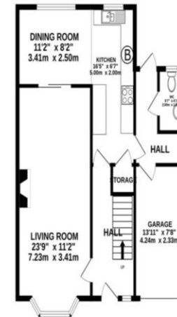
TOTAL FLOOR AREA: 1546 sq.ft. (143.6 sq.m.) approx.

While every attempt has been made to ensure the accuracy of the floorplan contained herein, measurements of doors, windows, rooms and any other items are approximate and no responsibility is taken for any error, omission or mis-statement. This plan is for descriptive purposes only and should be used for each by any prospective purchaser. The services, systems and appliances shown have not been tested and no guarantee as to their operability or efficiency can be given. Made with Metaplan C2024