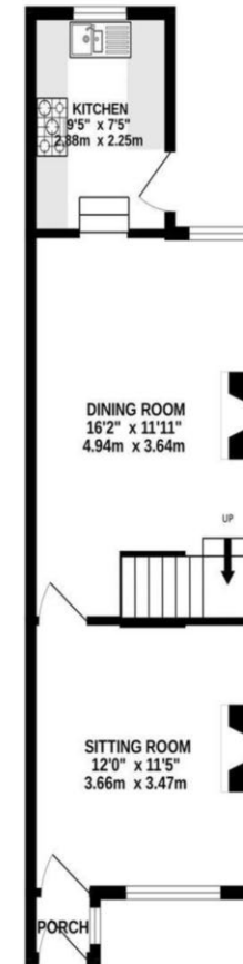
GROUND FLOOR 387 sq.ft. (35.0 sq.m.) approx.