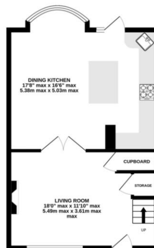
GROUND FLOOR 485 sq.ft. (45.1 sq.m.) approx.