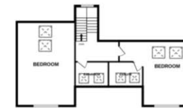
1ST FLOOR 825 sq.ft. (76.6 sq.m.) approx.