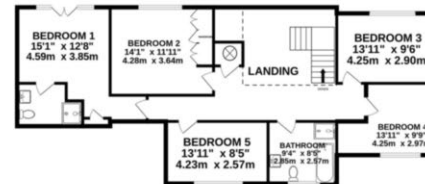
1ST FLOOR 1166 sq.ft. (108.3 sq.m.) approx.