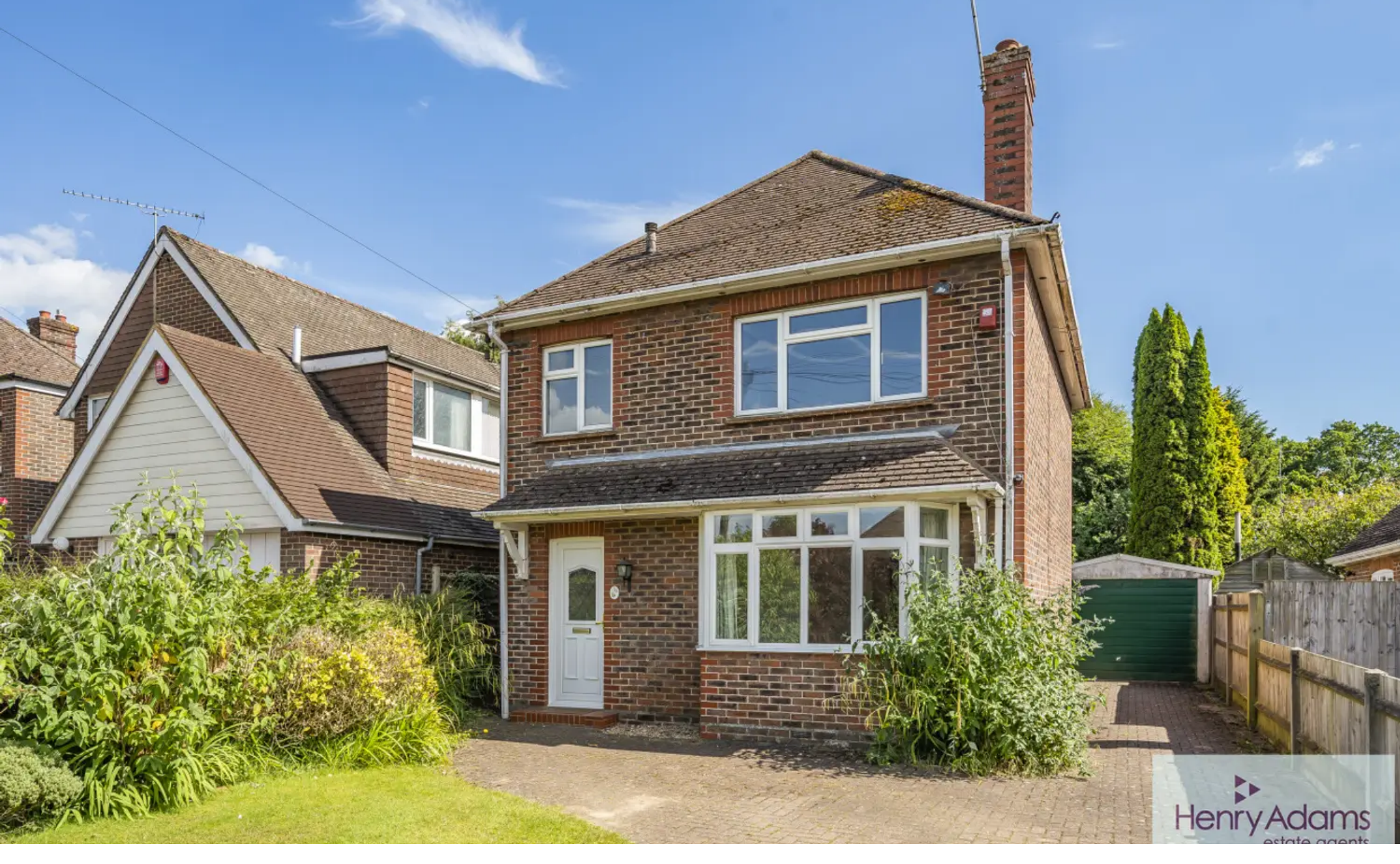
30 Forest Road, Horsham Guide Price £495,000