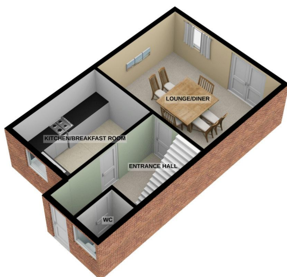
GROUND FLOOR 408 sq.ft. (37.9 sq.m.) approx.