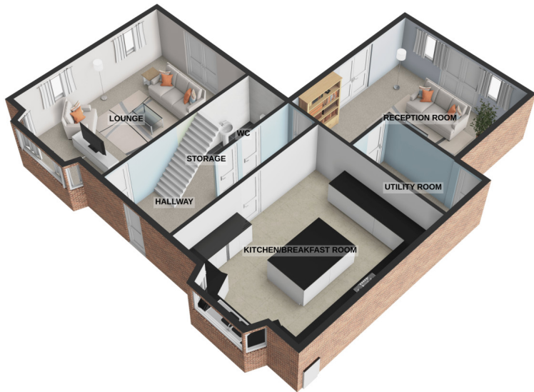
GROUND FLOOR 1043 sq.ft. (96.9 sq.m.) approx.