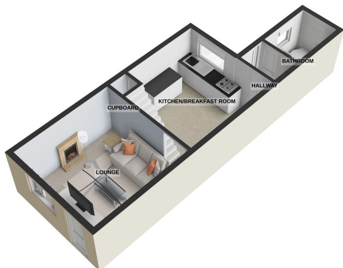
GROUND FLOOR 342 sq.ft. (31.8 sq.m.) approx.