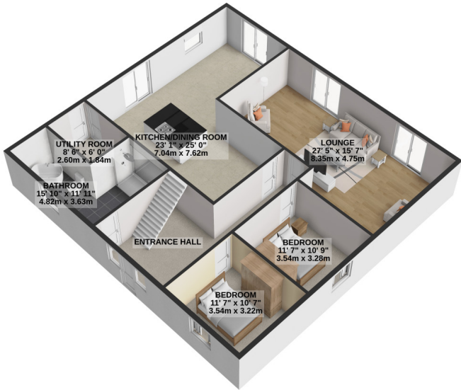
GROUND FLOOR 1442 sq.ft. (134.0 sq.m.) approx.