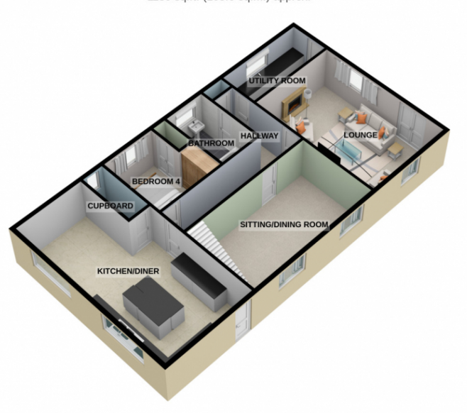
1ST FLOOR 822 sq.ft. (76.4 sq.m.) approx.