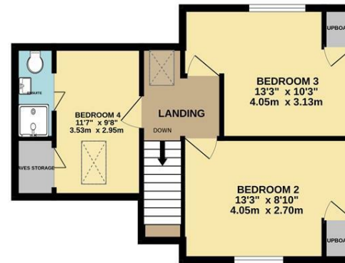
TOTAL FLOOR AREA : 1296 sq.ft. (120.4 sq.m.) approx.

Whilst every attempt has been made to ensure the accuracy of the floorplan contained here, measurements of doors, windows, rooms and any other items are approximate and no responsibility is taken for any error, omission or mis-statement. This plan is for illustrative purposes only and should be used as such by any prospective purchaser. The services, systems and appliances shown have not been tested and no guarantee as to their operability or efficiency can be given. Made with Metropix ©2023