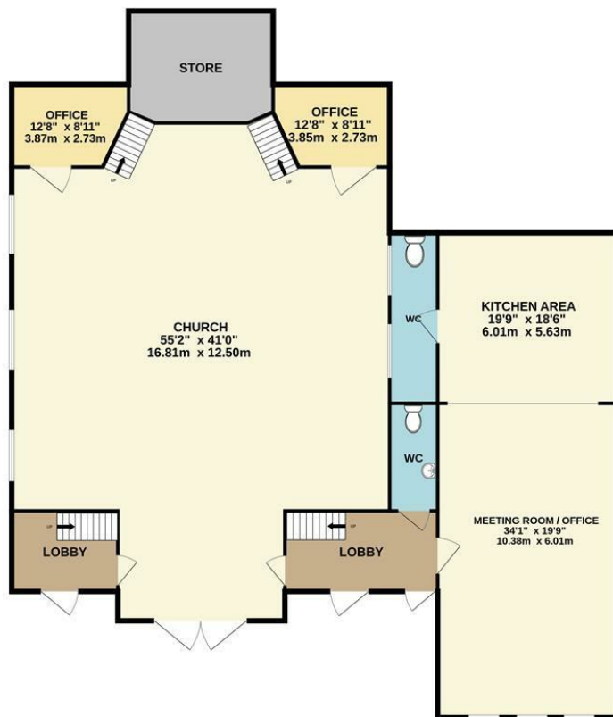
GROUND FLOOR 3672 sq.ft. (341.1 sq.m.) approx.