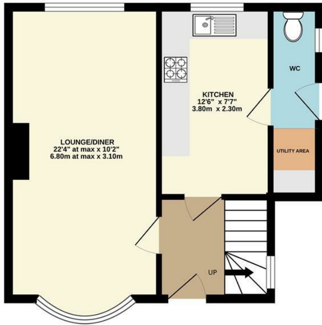
GROUND FLOOR 393 sq.ft. (36.5 sq.m.) approx.