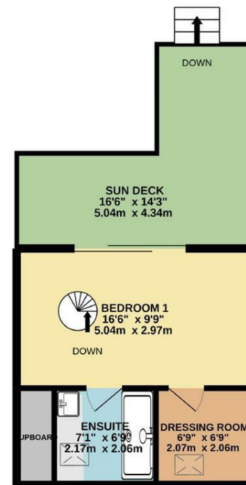
1ST FLOOR 273 sq.ft. (25.3 sq.m.) approx.