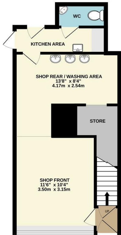
GROUND FLOOR 437 sq.ft. (40.6 sq.m.) approx.