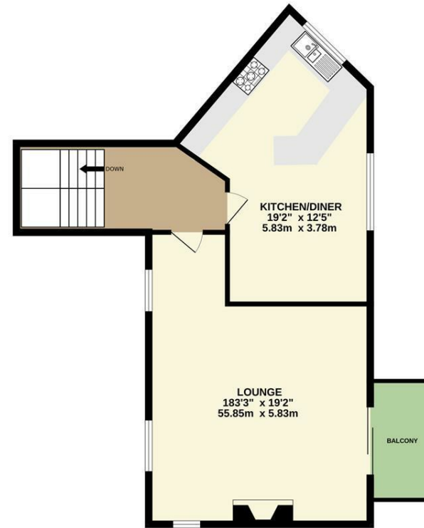
1ST FLOOR 691 sq.ft. (64.2 sq.m.) approx.