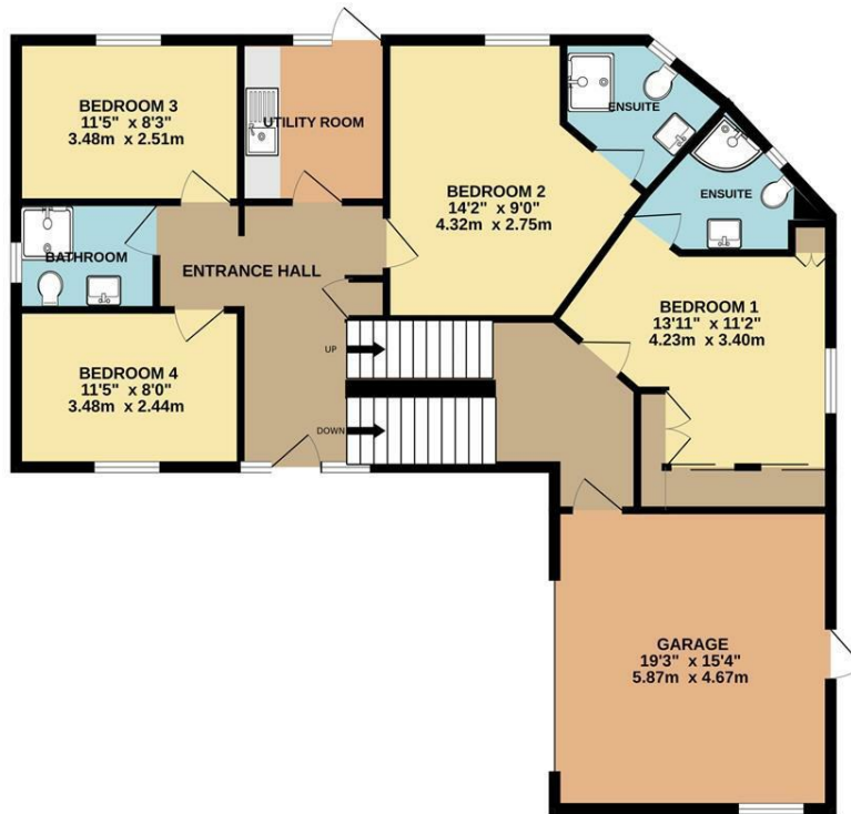
GROUND FLOOR 1094 sq.ft. (101.6 sq.m.) approx.