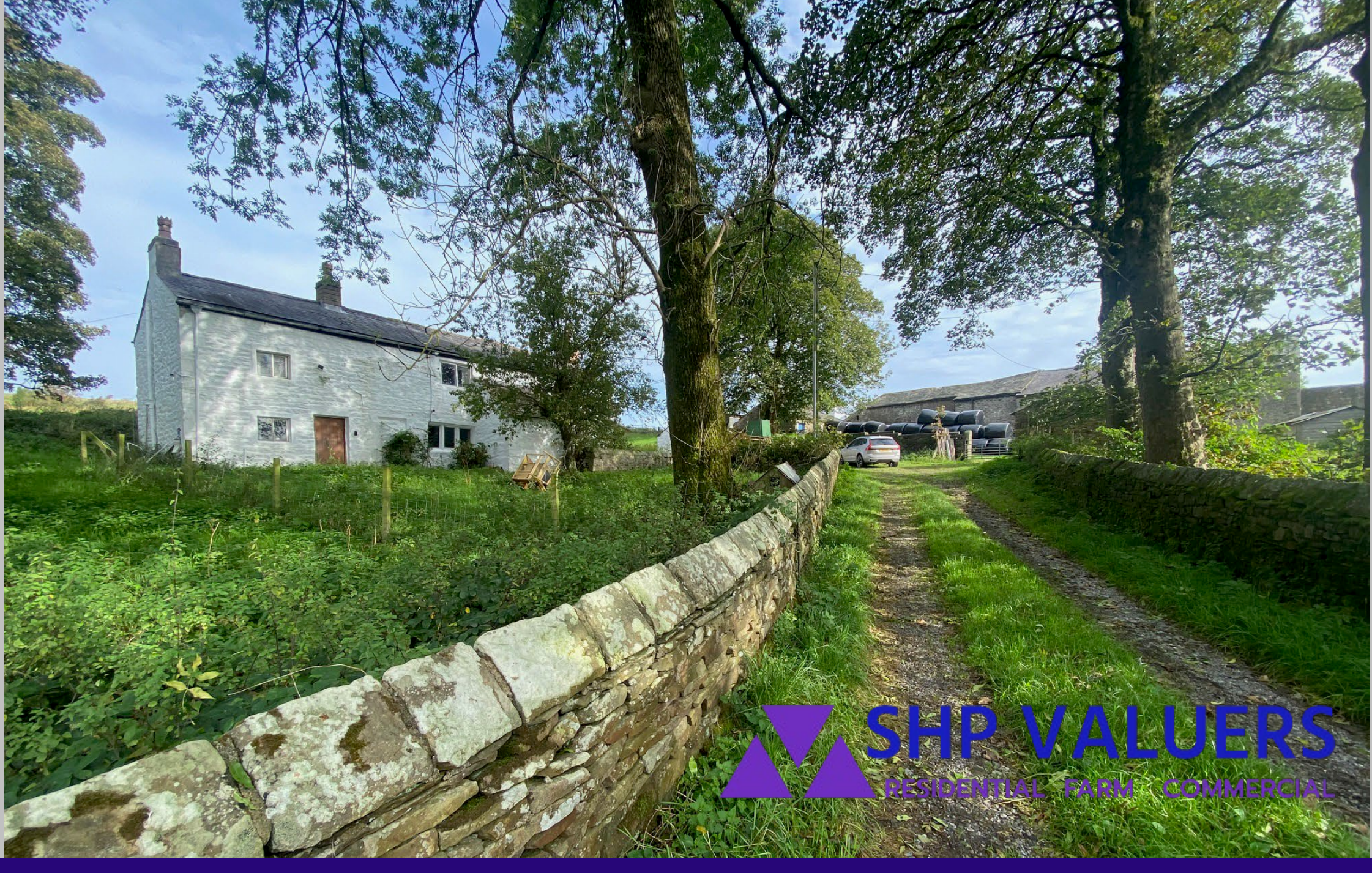
Hoardsall Farm, Lower Road, Longridge, Ribble Valley, Lancashire PR3 2YN Asking Price reduced to £1,650,000