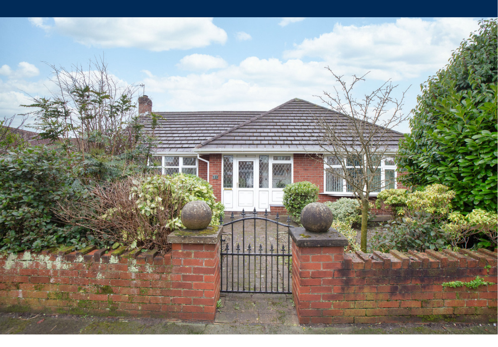
31 Albany Road, Lytham St. Annes FY8 4AT