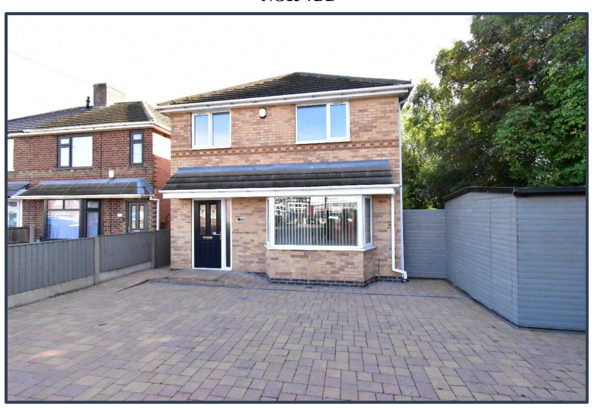
GUIDE PRICE £270,000 - £280,000

<u>VIEWING</u> By appointment through the selling agent on (0115) 9680809