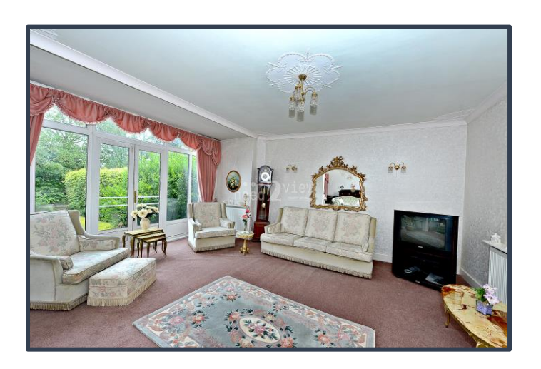
25'6" x 13" A spacious family room with windows to the front, patio doors to the front, radiator, power and ceiling light points.