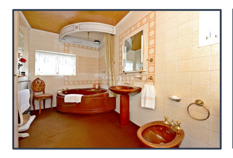
13" x 6'4" Brown four piece suite comprising of a wash hand basin, W.C., bidet and corner bath, fully tiled walls, towel radiator, opaque windows and ceiling light point.