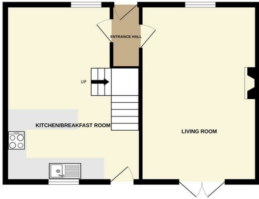
1ST FLOOR 535 sq.ft. (49.7 sq.m.) approx.