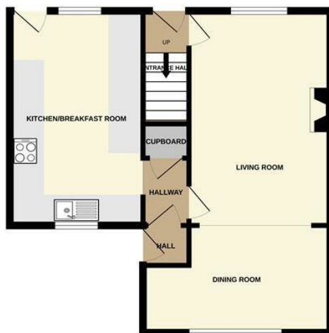
1ST FLOOR 411 sq.ft. (38.1 sq.m.) approx.