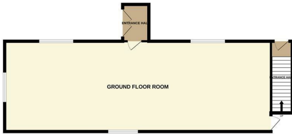
GROUND FLOOR 878 sq.ft. (81.6 sq.m.) approx.