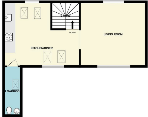
SECOND FLOOR 542 sq.ft. (50.4 sq.m.) approx.