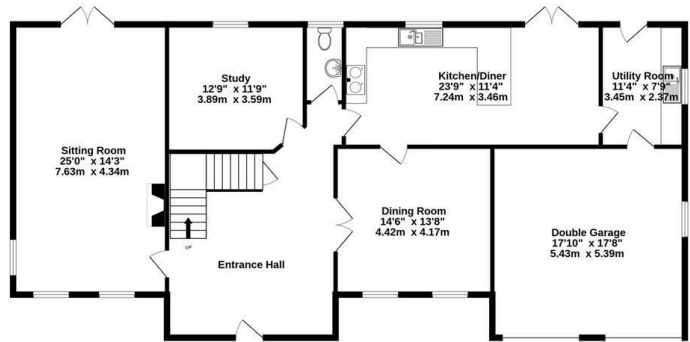
GROUND FLOOR 1682 sq.ft. (156.3 sq.m.) approx.