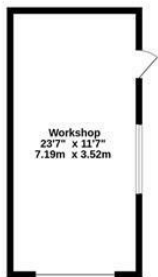
OUTBUILDING 273 sq.ft. (25.3 sq.m.) approx.