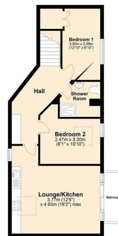
Coach House Apt, Hebden Bridge