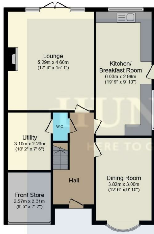
Ground Floor Floor area 84.5 sq.m. (910 sq.ft.)