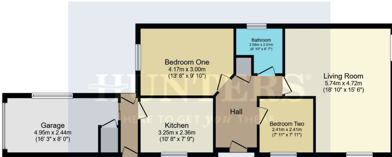
Floor Plan Floor area 75.9 sq.m. (817 sq.ft.)

Total floor area: 75.9 sq.m. (817 sq.ft.)