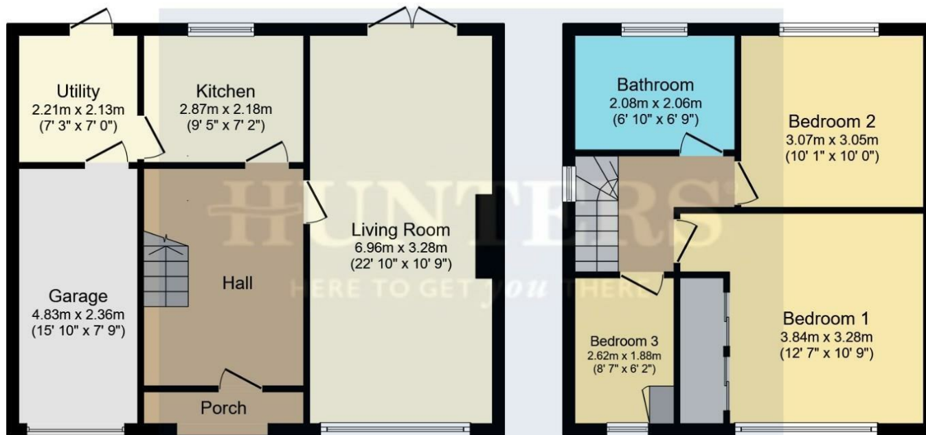
Ground Floor Floor area 59.0 sq.m. (636 sq.ft.) First Floor Floor area 43.5 sq.m. (468 sq.ft.)

Total floor area: 102.5 sq.m. (1,104 sq.ft.)