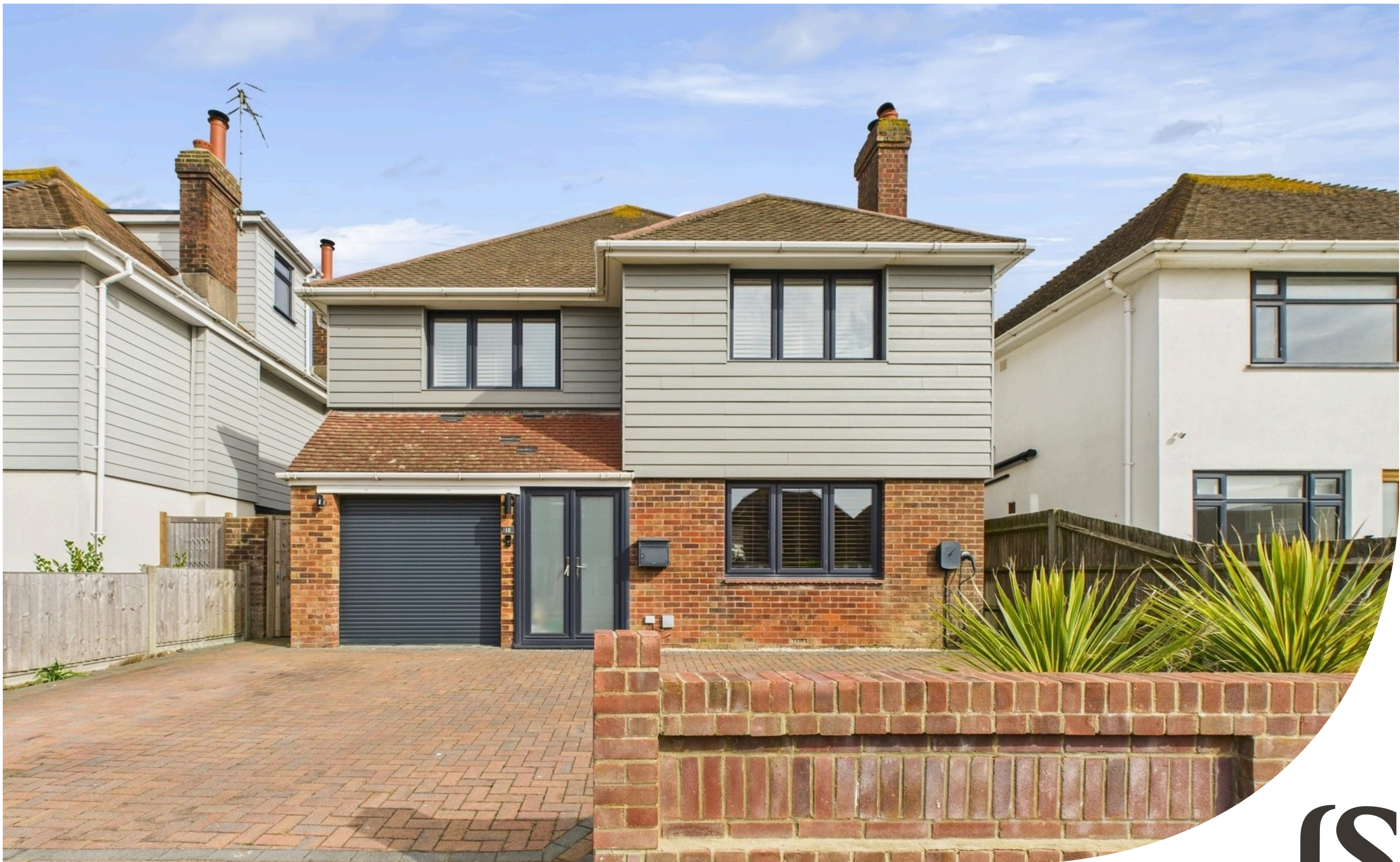
Bernard Road, Worthing, BN11 5EL Asking Price of £850,000