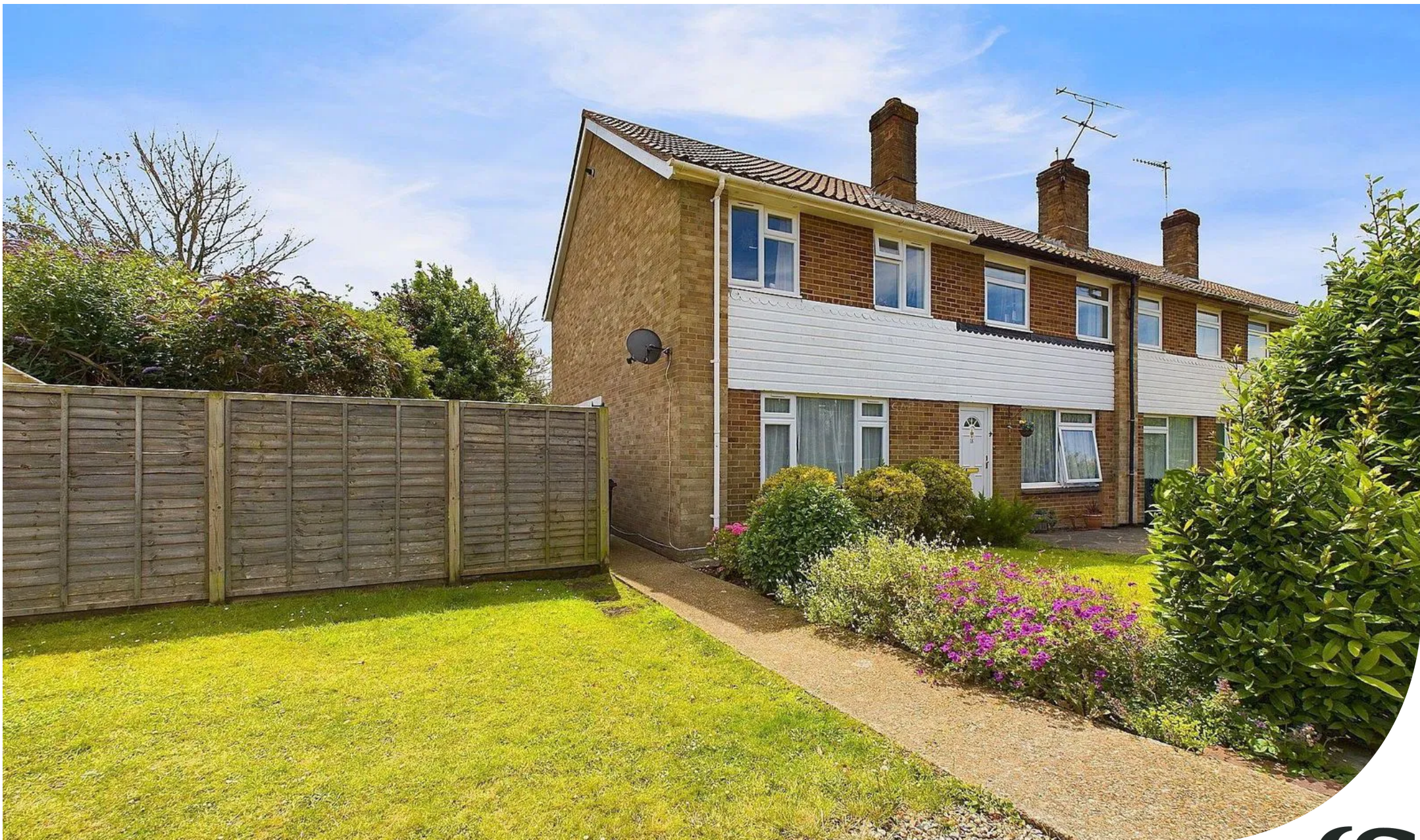
Somerset Close, Worthing, BN13 £350,000