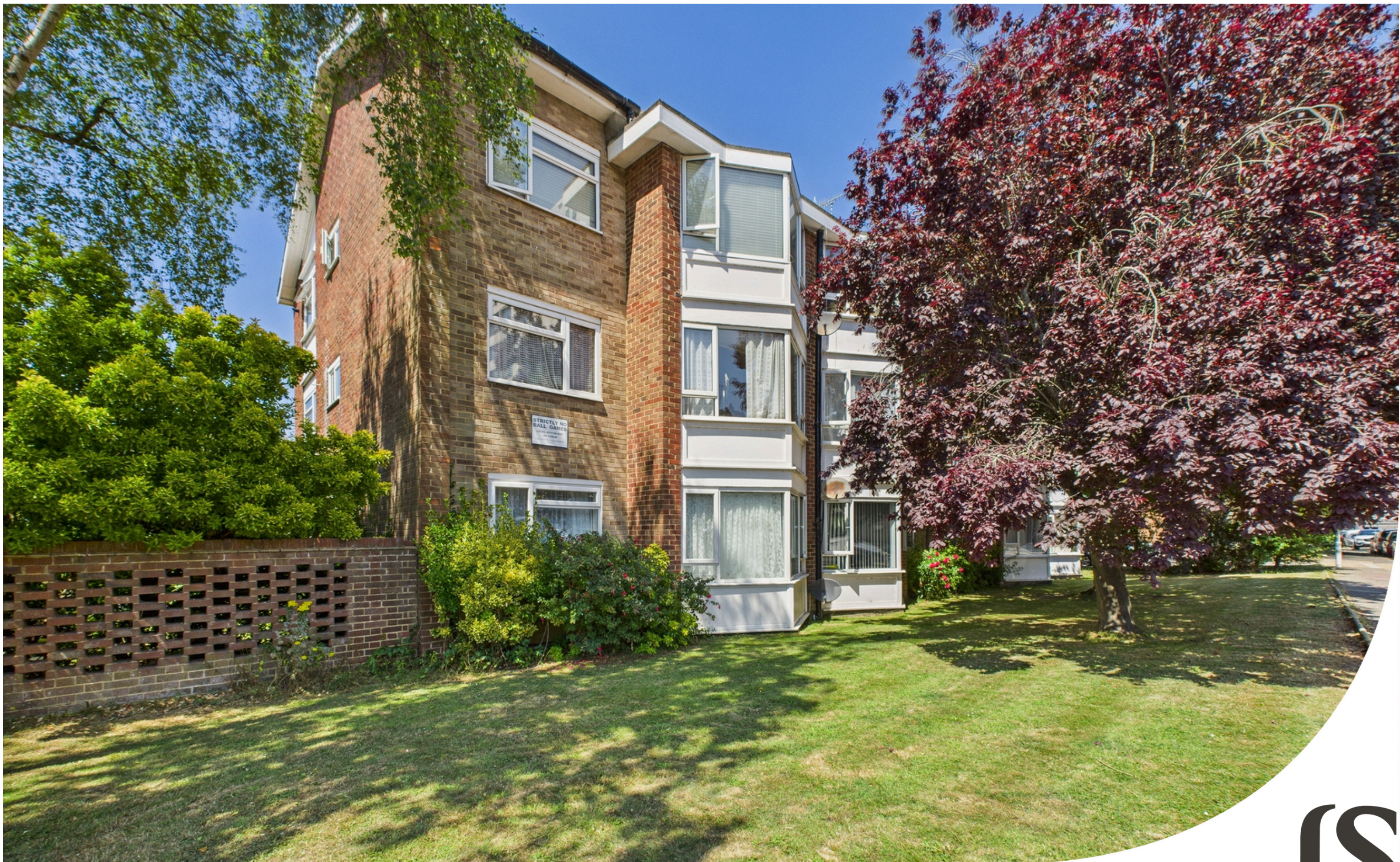
Durrington Gardens The Causeway, Worthing, BN12 6BX Guide Price £210,000