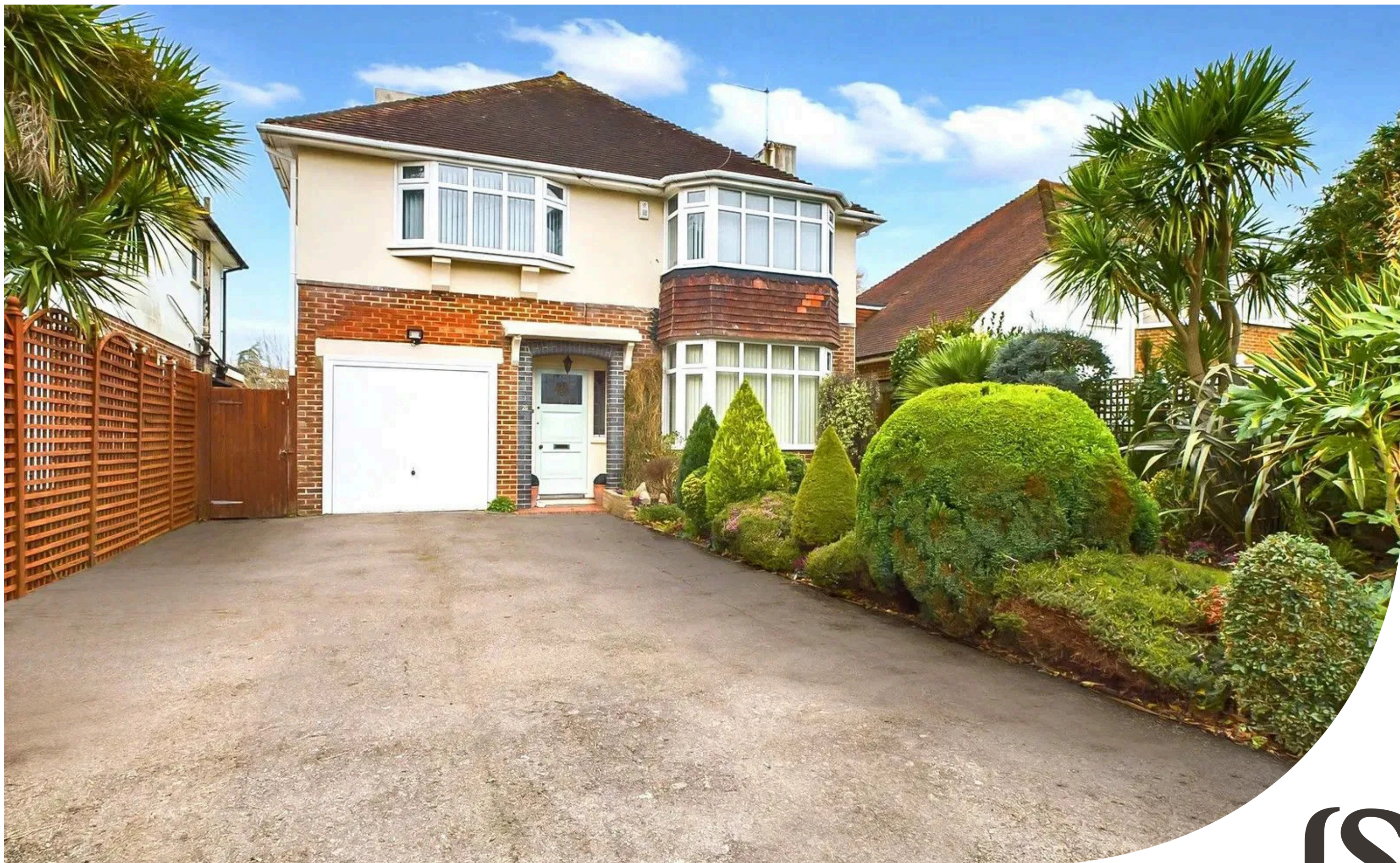
Trent Road, Goring-by-Sea, Worthing, BN12 4EL Offers Over £800,000