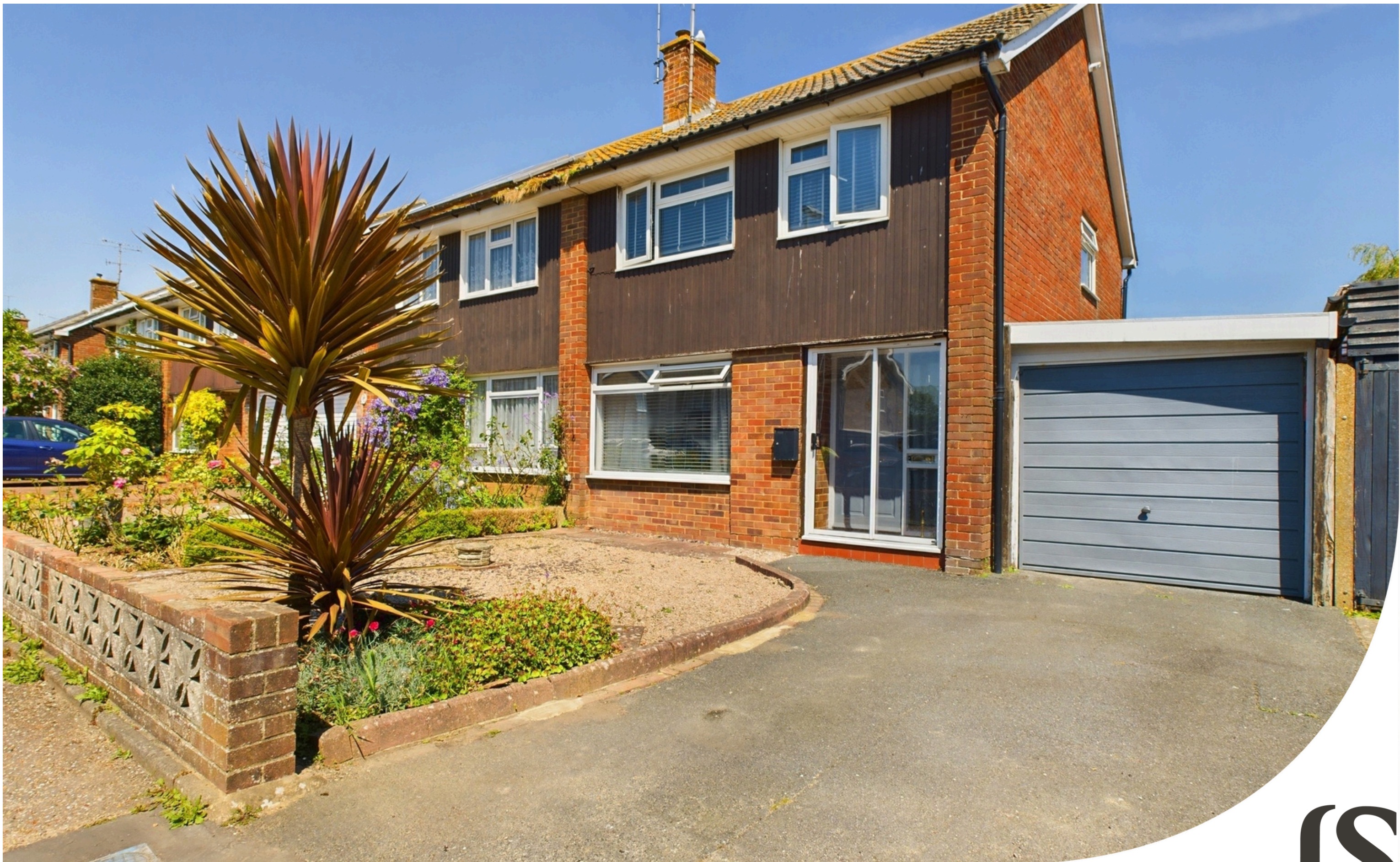
Lincoln Road, Worthing, BN13 1BG Offers Over £450,000