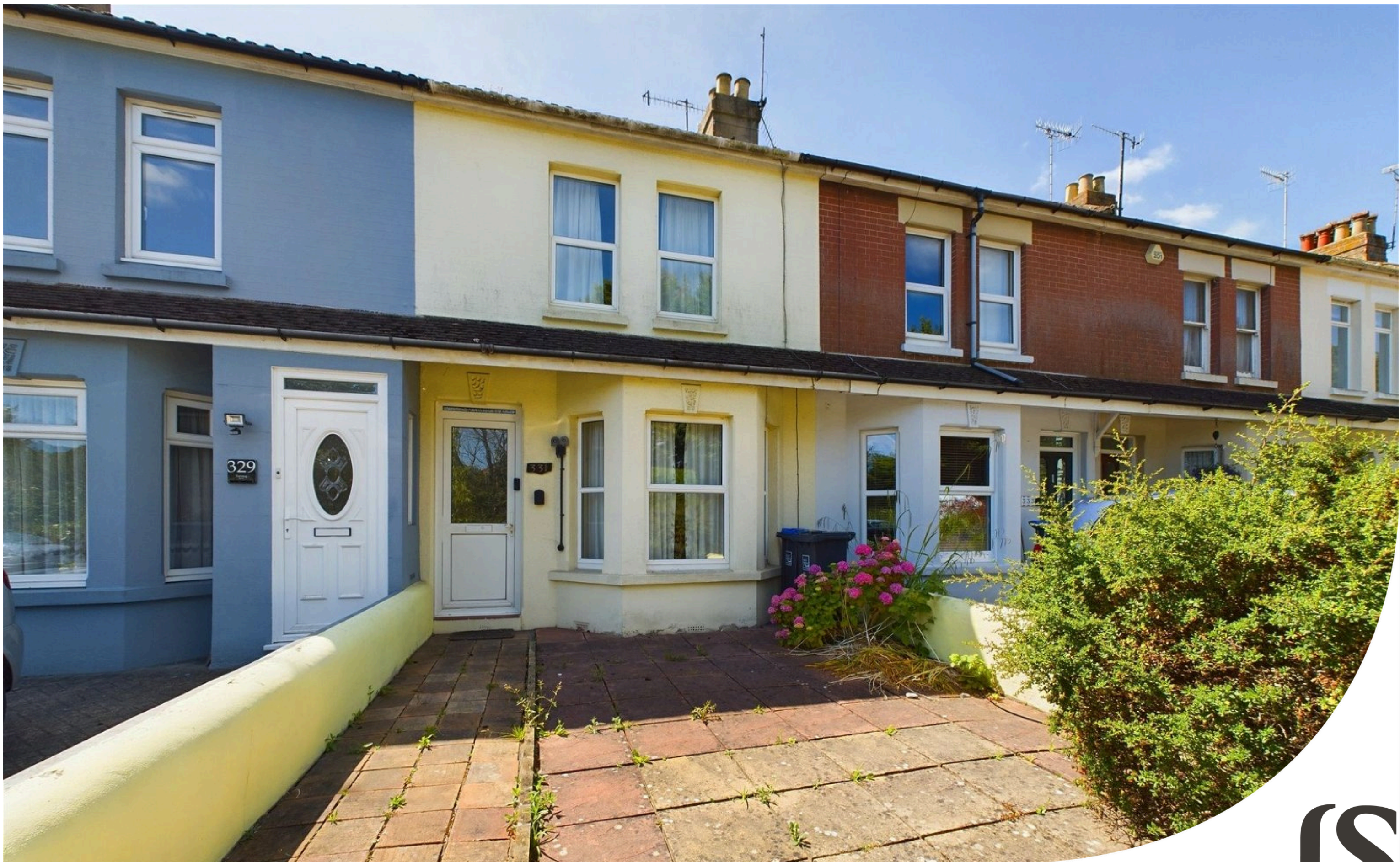
Tarring Road, West Worthing, Worthing, BN11 5JJ Guide Price £325,000