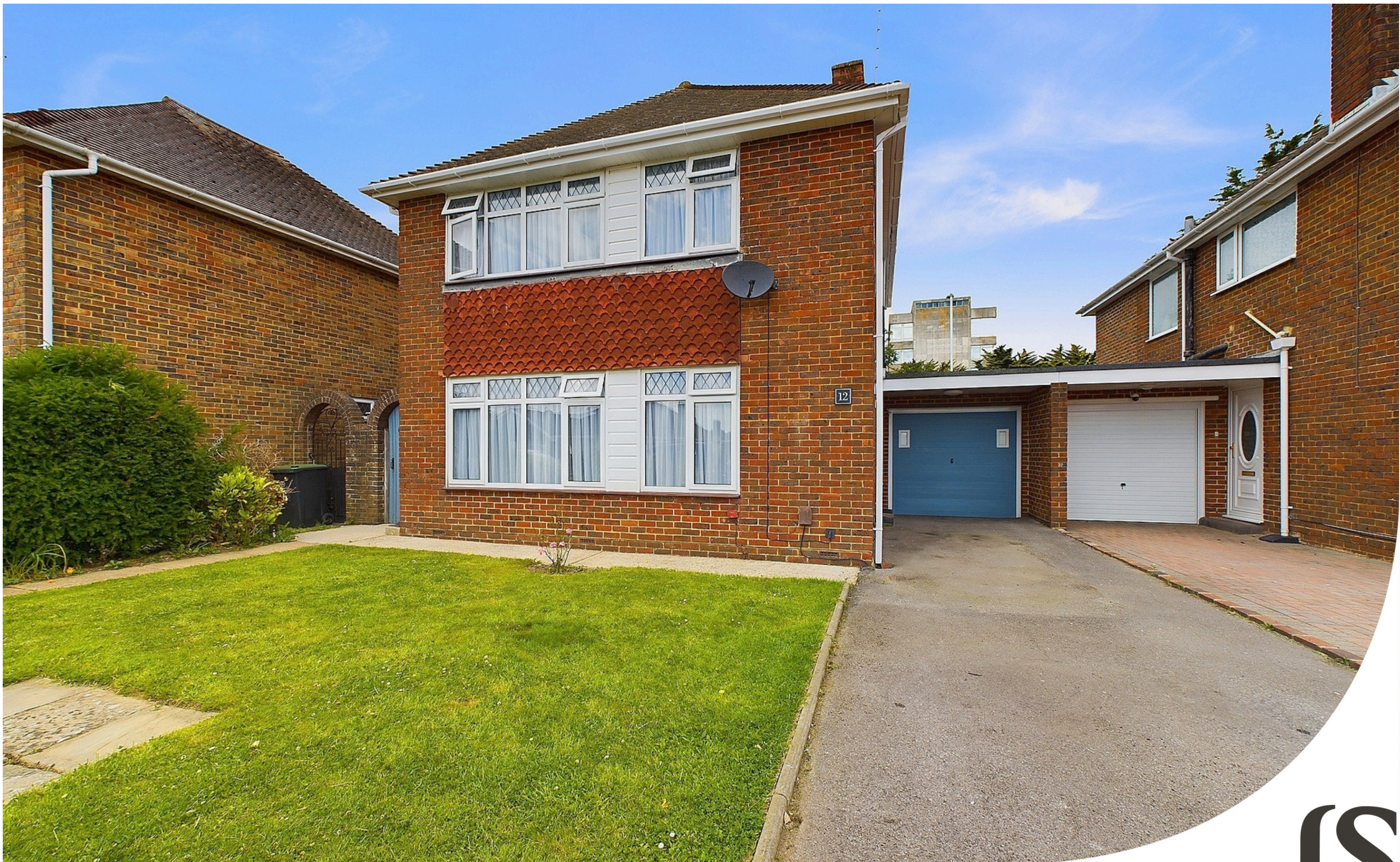
Cumberland Avenue, Goring-by-sea, Worthing, BN12 6JX Guide Price £440,000