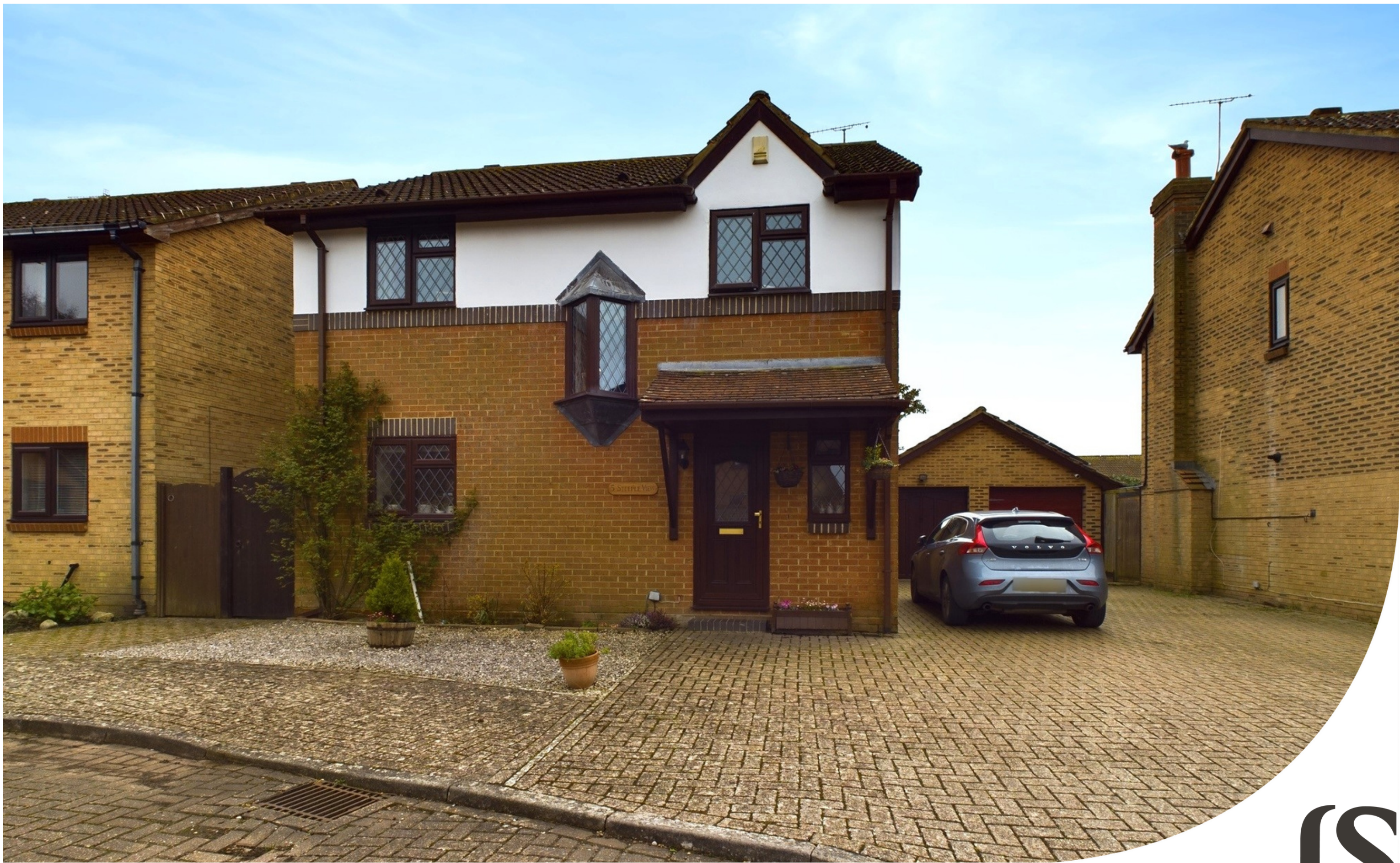
Steeple View | Worthing | West Sussex | BN13 1RP Offers Over £500,000